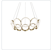
CH94829-AN Antique Brass