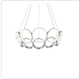
CH94829-AS Antique Silver